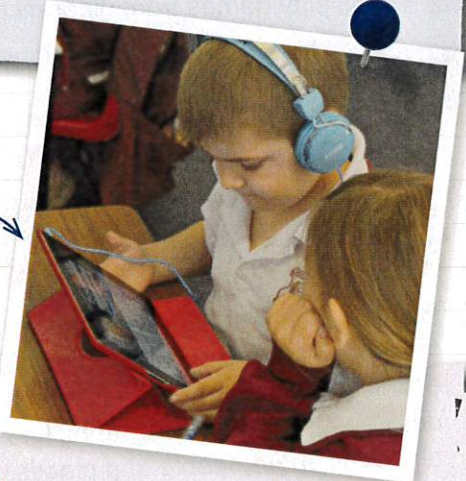
Uses a tablet to sequence steps