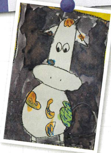
Creates artworks by drawing and painting